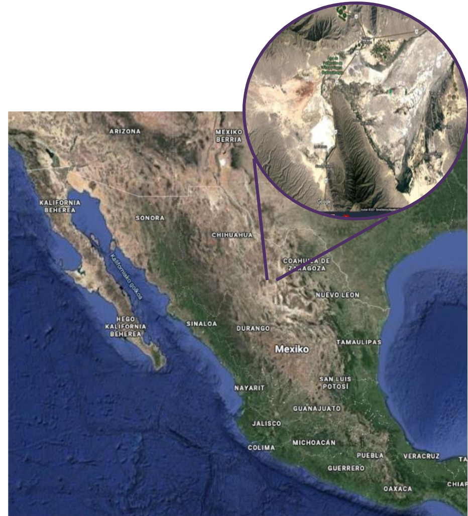
Cuatro Cienagas Basin (google maps)

Valeria found that these water movements provoke microbes and minerals of the ancient seas move towards the surface, leading to a highly diverse and unique microbial community composed by some the oldest organisms in the world.